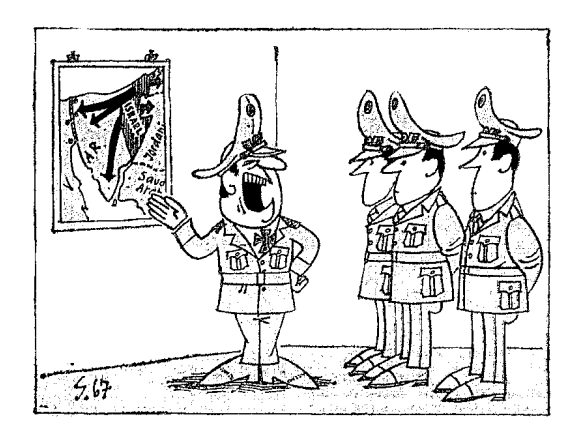
2 "People without space! Blitzkrieg! They have learned this from us. Comrades!"

only Israeli provocations in the run-up to the war and blamed Israel for abusing "the longing of Jews persecuted by Hitler's Fascism ... for a safe haven."<sup>30</sup>