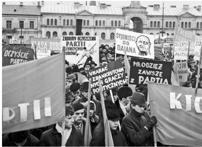
2 Antizionistische Demonstration in Kielce im März 1968

make the universal and unbridled upward mobility a permanent feature of 'socialist society'. This soon proved to be a false promise. Even the lavish and rash, often witless and most of the time economically unsound industrialization, like that undertaken under the communist auspices, could offer only limited room at the top. With expectations let loose, the pressure for purges soon turned into the endemic feature of the system.