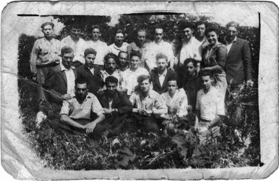
1 Group portrait of Polish survivors who are living temporarily in Szczecin before leaving for the west

ings or returning from Soviet exile/shelter had reasons to fear that Polish armed gangs or just their neighbours wary of the Jewish repossession claims would wish to complete the job left unfinished by the Nazis. According to various estimates, between 1000 and 3000 Jews were murdered in Poland in the months following the end of the war. The 'rail action' alone (in which Jews were picked up from the trains bringing exiled Poles from Russia and shot on the spot) resulted in about 200 deaths and was designed and managed by the NSZ ('National Armed Forces'), reputedly the most extreme right-wing sections of the Polish underground. By July 1945, the Central Committee of Polish Jews reported more than 100 people murdered all over Polish territory in just two months – in Przedbórz, Suchedniów, Żerán, Wierzbnik, Zabłudów, Suchowola and Tarnogród. There was a pogrom in August 1945 in Kraków, another in February 1946 in Parczew; anti-Jewish riots were recorded, among other places, in Rzeszów, Lublin, Radom, Miechów, Chrzanów and Częstochowa. Murders were perpetrated without mercy, sparing neither women nor children; some victims, before being murdered, were demeaned and humiliated. Some incidents were particularly heinous – such as when two armed men entered the Szarytek hospital in Lublin and murdered all Jewish patients, or when Jewish children with tuberculous were attacked in the Rabka Sanatorium. Of